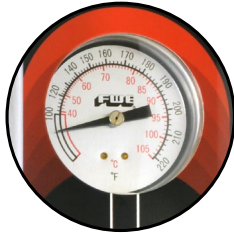
PLEXI-GUARD THERMOMETER COVER