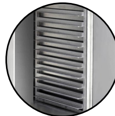
ONE PIECE RACK ASSEMBLY (SPECIFY SPACINGS)