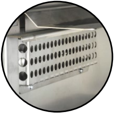
THERMOSTAT CAPILLARY GUARD