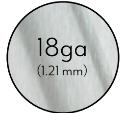
18 GAUGE STAINLESS STEEL EXTERIOR