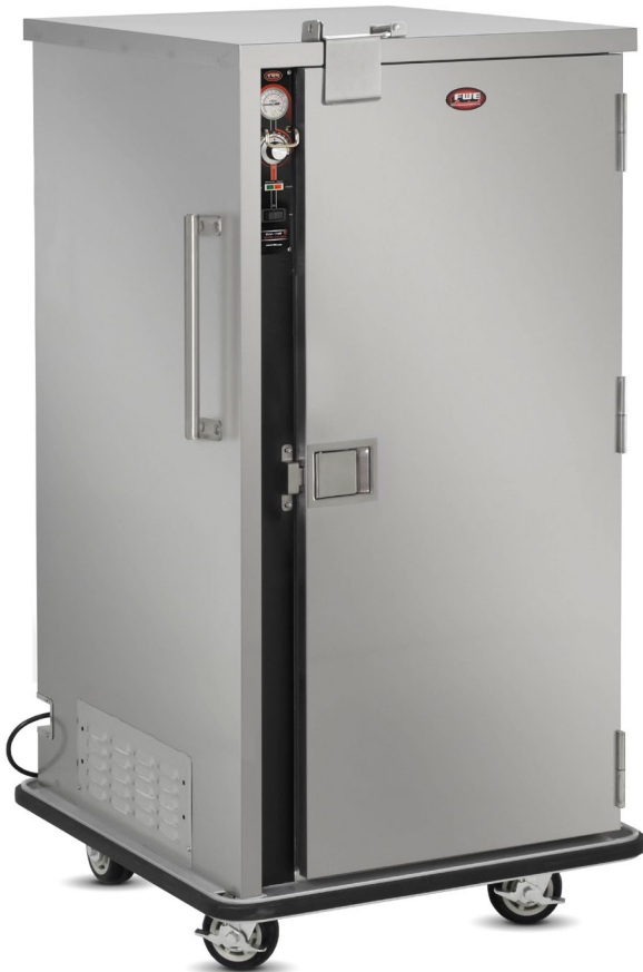
UHS-10 HDM Level 2

INCLUDES LEVEL 1 FEATURES PLUS THE FOLLOWING UPGRADES