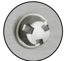
TAMPER-PROOF FASTENERS (INSIDE & OUT)