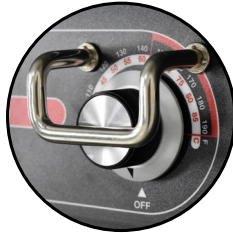
THERMOSTAT RETENTION STRAP