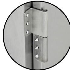
STAINLESS STEEL HEAVY-DUTY HINGES