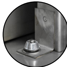
RACK HOLD DOWN DEVICE

INCLUDES LEVEL 1 & 2 FEATURES PLUS THE FOLLOWING UPGRADES LEVEL 3 DOES NOT INCLUDE A WATER PAN.