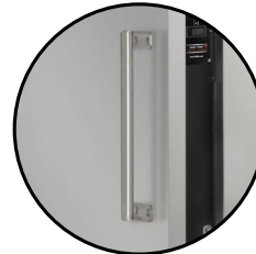
TUBULAR STAINLESS STEEL HANDLES