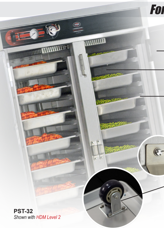
PST-32 Shown with HDM Level 2

To Learn More About FWE & Correctional Equipment Call to Speak with a Correctional Expert at (800) 222-4393 or Visit Us Online at www.FWE.com/Correctional