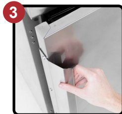
Magnetic Workflow Door Handle