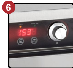
User Friendly Electronic Controls