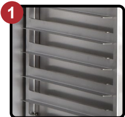
Versatile Fixed Rack