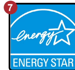
Energy Star Approved